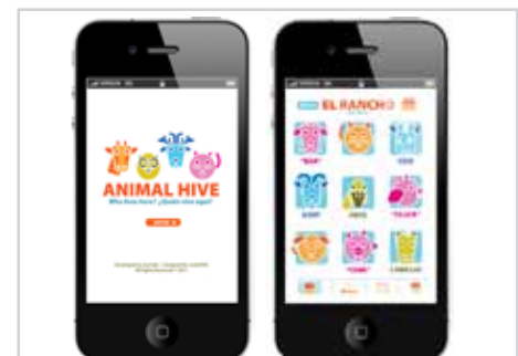
ANIMAL HIVE CHILDREN APP UI & DESIGN