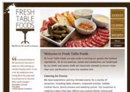
FRESH TABLE FOODS BRANDING & WEBSITE