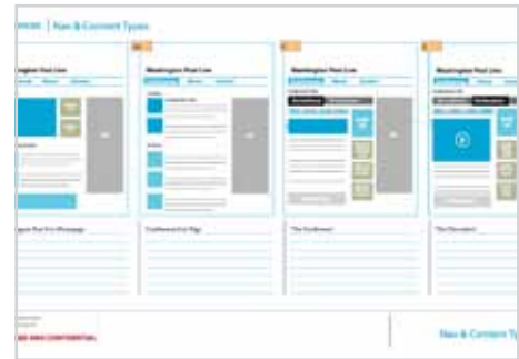
WASHINGTON POST LIVE TEMPLATE BLOCKS