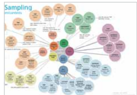
WASHINGTON POST CONTEST CONTENT ANALYSIS