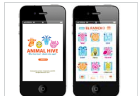
ANIMAL HIVE CHILDREN APP UI & DESIGN