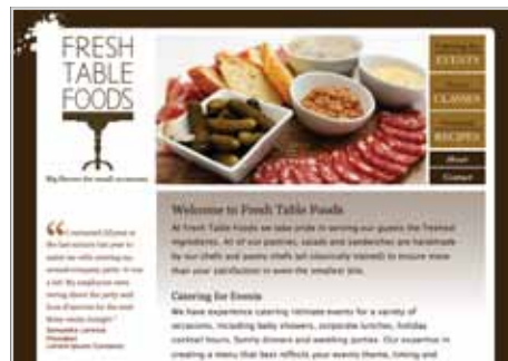
FRESH TABLE FOODS BRANDING & WEBSITE